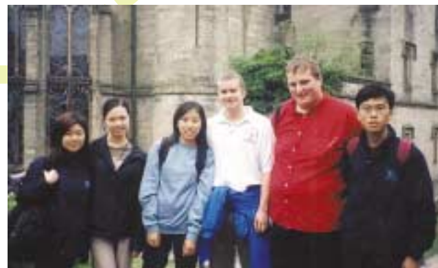
An old old castle in the Alton Tower