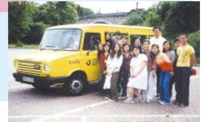
The yellow bus! We love it!