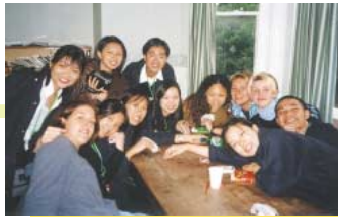
Apart from the Wirral Group, we also spent time with the Slovenia Group.