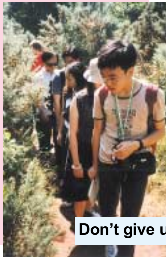
Don't give up guys!