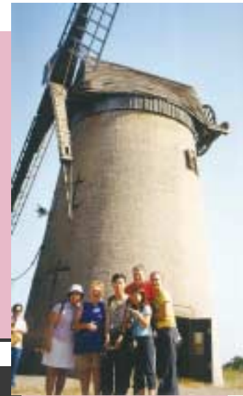
Cool! That's lovely!