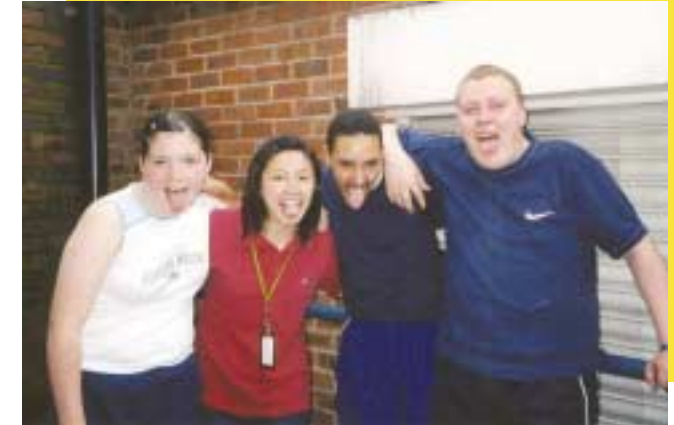
Show me your tongue! Errrrr...