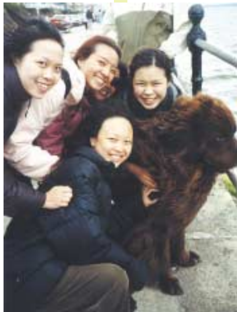
Look at their hair. It's so windy!